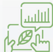
SMART FARMING ANALYSIS Dashboard