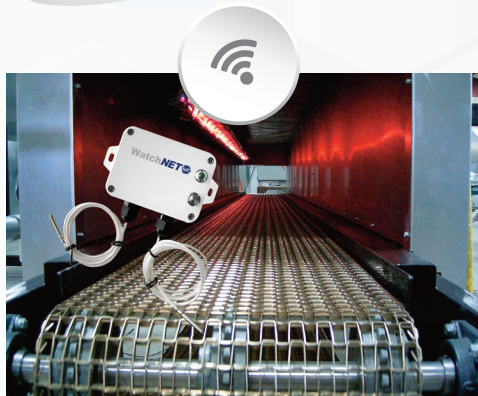
Hot baking oven