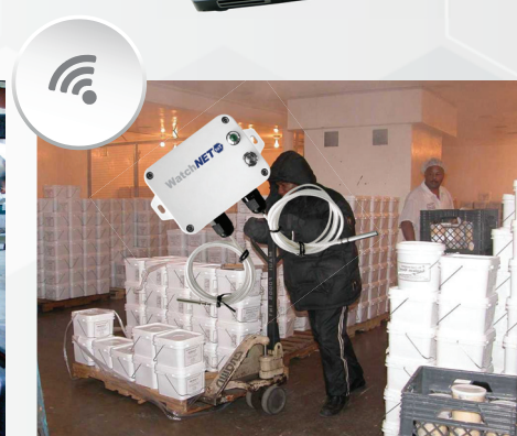
Deep freeze storage