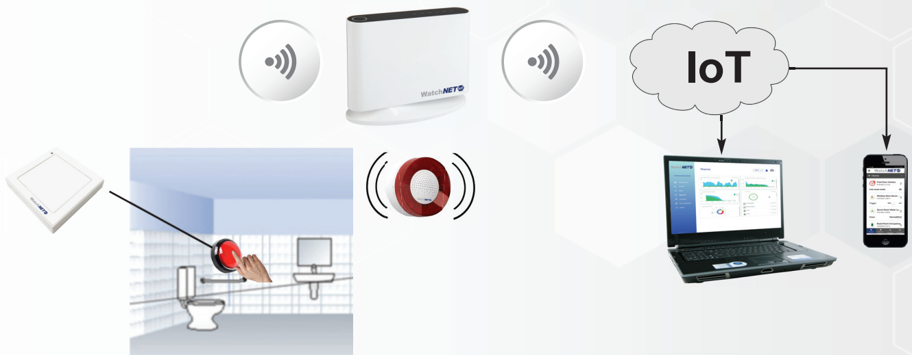
Wireless Emergency Alert System